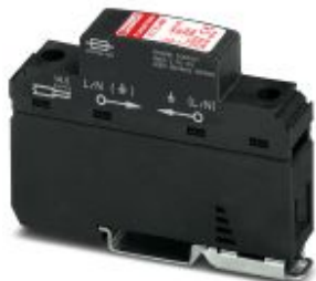
Type 1 / Class I / B arrester (lightning current arrester) with arc chopping spark gap, 1-channel. Housing width: 17.5 mm (1 Div.)

Please be informed that the data shown in this PDF Document is generated from our Online Catalog. Please find the complete data in the user's documentation. Our General Terms of Use for Downloads are valid ( http://phoenixcontact.com/download )