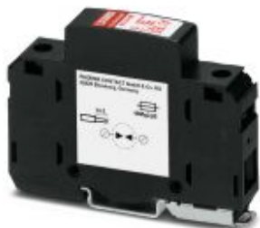
Type 1 / Class I / B arrester (lightning current arrester) with encapsulated arc chopping spark gap, 1-channel. Housing width: 17.5 mm (1 Div.)

Please be informed that the data shown in this PDF Document is generated from our Online Catalog. Please find the complete data in the user's documentation. Our General Terms of Use for Downloads are valid ( http://phoenixcontact.com/download )