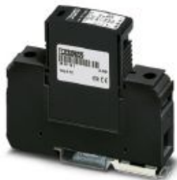
Lightning/surge arrester, consisting of base element and protective plug with N-PE total current spark gap, for mounting on NS 35/7,5. Housing width: 17.5 mm (1TE)

Please be informed that the data shown in this PDF Document is generated from our Online Catalog. Please find the complete data in the user's documentation. Our General Terms of Use for Downloads are valid ( http://phoenixcontact.com/download )