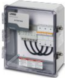
Indoor/outdoor lightning current arrester and TVSS system for 277/480 V Wye system

Please be informed that the data shown in this PDF Document is generated from our Online Catalog. Please find the complete data in the user's documentation. Our General Terms of Use for Downloads are valid ( http://phoenixcontact.com/download )