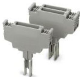
Component plug, with light indicator, to connect 2-pos. components into the basic terminal block, height: 19 mm, color: Gray, voltage light indicator: 24 V DC

Please be informed that the data shown in this PDF Document is generated from our Online Catalog. Please find the complete data in the user's documentation. Our General Terms of Use for Downloads are valid ( http://phoenixcontact.com/download )