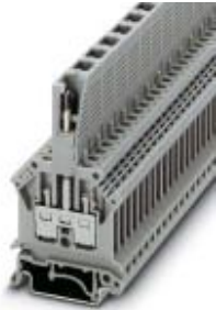
Component connector, pitch: 6 mm, number of positions: 1, color: gray

Please be informed that the data shown in this PDF Document is generated from our Online Catalog. Please find the complete data in the user's documentation. Our General Terms of Use for Downloads are valid ( http://phoenixcontact.com/download )