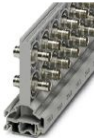
BNC connector, double-level, for mounting on NS 32 or NS 35/7.5, wave impedance: 50 Ohm

Please be informed that the data shown in this PDF Document is generated from our Online Catalog. Please find the complete data in the user's documentation. Our General Terms of Use for Downloads are valid ( http://phoenixcontact.com/download )