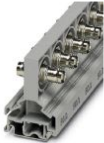
BNC connector, single-level, for mounting on NS 32 or NS 35/7.5, wave impedance: 50 Ohm

Please be informed that the data shown in this PDF Document is generated from our Online Catalog. Please find the complete data in the user's documentation. Our General Terms of Use for Downloads are valid ( http://phoenixcontact.com/download )