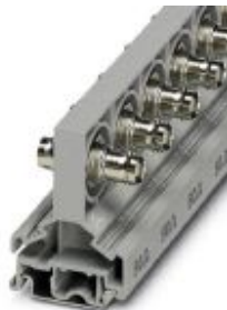
BNC connector, single-level, for mounting on NS 32 or NS 35/7.5, wave impedance: 75 Ohm

Please be informed that the data shown in this PDF Document is generated from our Online Catalog. Please find the complete data in the user's documentation. Our General Terms of Use for Downloads are valid ( http://phoenixcontact.com/download )