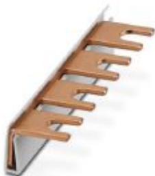
Wiring bridge for modules with connecting pitch 17.5 mm, 1-phase, 4-pos.

Please be informed that the data shown in this PDF Document is generated from our Online Catalog. Please find the complete data in the user's documentation. Our General Terms of Use for Downloads are valid ( http://phoenixcontact.com/download )