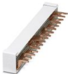
Wiring bridge for modules with connecting pitch 17.5 mm, 4-phase, 8-pos.

Please be informed that the data shown in this PDF Document is generated from our Online Catalog. Please find the complete data in the user's documentation. Our General Terms of Use for Downloads are valid ( http://phoenixcontact.com/download )