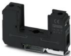
Base element for type 2 arresters of the VALVETRAB MS series of products. Design: 1-channel

Please be informed that the data shown in this PDF Document is generated from our Online Catalog. Please find the complete data in the user's documentation. Our General Terms of Use for Downloads are valid ( http://phoenixcontact.com/download )