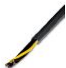
Power supply cable, gray, welding-splash-resistant in standard applications, 5 x 1.5 mm 2 , sold by the meter