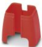
Security element for FL patch cable

Port Guard Security Element - FL PATCH SAFE CLIP - 2891246