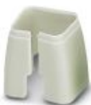
Color marking for patch cable, gray

Color-coding - FL PATCH CCODE GY - 2891699