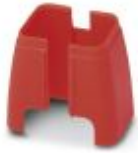
Security element for FL patch cable

Port Guard Security Element - FL PATCH SAFE CLIP - 2891246