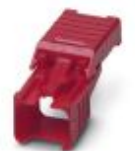
Lockable security element

Port Guard Security Element - FL PATCH GUARD - 2891424