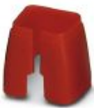
Color marking for patch cable, red

Color-coding - FL PATCH CCODE RD - 2891893