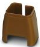
Color marking for patch cable, brown

Color-coding - FL PATCH CCODE BN - 2891495