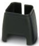
Color marking for patch cable, black

Color-coding - FL PATCH CCODE BK - 2891194