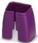
Color marking for patch cable, purple

Color-coding - FL PATCH CCODE VT - 2891990