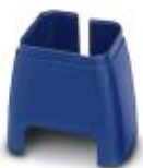
Color marking for patch cable, blue

Color-coding - FL PATCH CCODE BU - 2891291