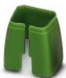
Color marking for patch cable, green

Color-coding - FL PATCH CCODE GN - 2891796