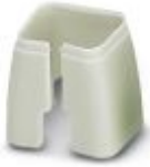
Color marking for patch cable, gray

Color-coding - FL PATCH CCODE GY - 2891699