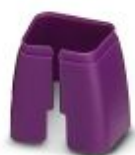
Color marking for patch cable, purple

Color-coding - FL PATCH CCODE VT - 2891990