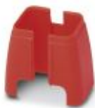
Security element for FL patch cable

Port Guard Security Element - FL PATCH SAFE CLIP - 2891246