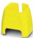
Color marking for patch cable, yellow

Color-coding - FL PATCH CCODE YE - 2891592