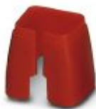
Color marking for patch cable, red

Color-coding - FL PATCH CCODE RD - 2891893