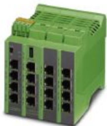
Rail-mountable Ethernet hub with 16 RJ45 ports, supports Ethernet with 10 Mbps as well as 100 Mbps

Please be informed that the data shown in this PDF Document is generated from our Online Catalog. Please find the complete data in the user's documentation. Our General Terms of Use for Downloads are valid ( http://phoenixcontact.com/download )