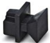
Dust protection caps for RJ45 socket

Dust protection - FL RJ45 PROTECT CAP - 2832991