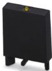
Plug-in module, for mounting on PR3, with varistor and yellow LED, input voltage: 12 ... 24 V DC ±20 %

Please be informed that the data shown in this PDF Document is generated from our Online Catalog. Please find the complete data in the user's documentation. Our General Terms of Use for Downloads are valid ( http://phoenixcontact.com/download )