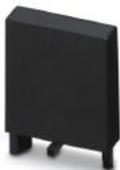
Plug-in module, with RC element, input voltage: 120 ... 230 V AC/DC ±20 %

Please be informed that the data shown in this PDF Document is generated from our Online Catalog. Please find the complete data in the user's documentation. Our General Terms of Use for Downloads are valid ( http://phoenixcontact.com/download )