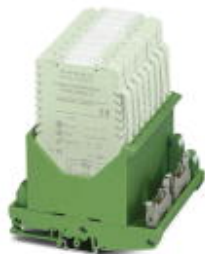
Analog IN-motherboard for S7-300, to hold PI-C-UI-UI-AI, mounting on NS 32, or NS 35/7.5.

Please be informed that the data shown in this PDF Document is generated from our Online Catalog. Please find the complete data in the user's documentation. Our General Terms of Use for Downloads are valid ( http://phoenixcontact.com/download )