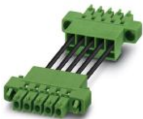
Spare local bus cable, for INTERBUS-ST modules

Please be informed that the data shown in this PDF Document is generated from our Online Catalog. Please find the complete data in the user's documentation. Our General Terms of Use for Downloads are valid ( http://phoenixcontact.com/download )