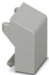
DIN rail housing, Filler plug for unoccupied terminal points, color: light gray (7035)

Please be informed that the data shown in this PDF Document is generated from our Online Catalog. Please find the complete data in the user's documentation. Our General Terms of Use for Downloads are valid ( http://phoenixcontact.com/download )