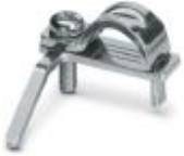
Shield connection clamp for printed circuit terminal block

Shield connection clamp - ME-SAS - 2853899