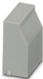
DIN rail housing, Filler plug for unoccupied terminal points, color: light gray (7035)

Please be informed that the data shown in this PDF Document is generated from our Online Catalog. Please find the complete data in the user's documentation. Our General Terms of Use for Downloads are valid ( http://phoenixcontact.com/download )