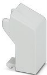
DIN rail housing, Filler plug for unoccupied terminal points, color: light gray (7035)

Please be informed that the data shown in this PDF Document is generated from our Online Catalog. Please find the complete data in the user's documentation. Our General Terms of Use for Downloads are valid ( http://phoenixcontact.com/download )