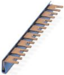
Wiring bridge for modules with connecting pitch 17.5 mm, 1-phase, 8-pos., color: Blue

Please be informed that the data shown in this PDF Document is generated from our Online Catalog. Please find the complete data in the user's documentation. Our General Terms of Use for Downloads are valid ( http://phoenixcontact.com/download )