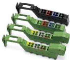
Connector set for bus terminal module, copper

Please be informed that the data shown in this PDF Document is generated from our Online Catalog. Please find the complete data in the user's documentation. Our General Terms of Use for Downloads are valid ( http://phoenixcontact.com/download )