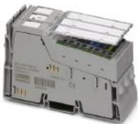
Inline power terminal block, complete with accessories (connector and labeling field), without fuse, 230 V AC

Please be informed that the data shown in this PDF Document is generated from our Online Catalog. Please find the complete data in the user's documentation. Our General Terms of Use for Downloads are valid ( http://phoenixcontact.com/download )