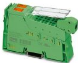
Inline RS-485/422 function terminal block, complete with accessories (connector and labeling field), 1 serial input and output channel

Please be informed that the data shown in this PDF Document is generated from our Online Catalog. Please find the complete data in the user's documentation. Our General Terms of Use for Downloads are valid ( http://phoenixcontact.com/download )