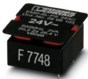
Power modules, pluggable, for EMD-SL-..., supply voltage: 20.2...26.4 V AC

Please be informed that the data shown in this PDF Document is generated from our Online Catalog. Please find the complete data in the user's documentation. Our General Terms of Use for Downloads are valid ( http://phoenixcontact.com/download )