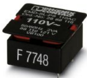
Power modules, pluggable, for EMD-SL-..., supply voltage: 88...121 V AC

Please be informed that the data shown in this PDF Document is generated from our Online Catalog. Please find the complete data in the user's documentation. Our General Terms of Use for Downloads are valid ( http://phoenixcontact.com/download )