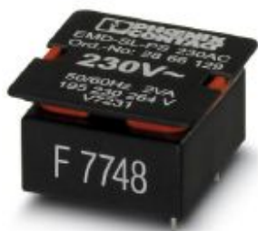
Power modules, pluggable, for EMD-SL-..., supply voltage: 195...264 V AC

Please be informed that the data shown in this PDF Document is generated from our Online Catalog. Please find the complete data in the user's documentation. Our General Terms of Use for Downloads are valid ( http://phoenixcontact.com/download )