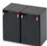
Replacement battery for UPS-BAT/VRLA... energy storage

Uninterruptible power supply replacement battery - UPS-BAT-KIT-VRLA 2X12V/12AH - 2908235