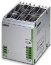
Primary-switched TRIO POWER power supply for DIN rail mounting, input: 1-phase, output: 48 V DC/10 A

Please be informed that the data shown in this PDF Document is generated from our Online Catalog. Please find the complete data in the user's documentation. Our General Terms of Use for Downloads are valid ( http://phoenixcontact.com/download )