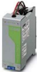
Energy storage device, lead AGM, VRLA technology, 12 V DC, 2.6 Ah.

Please be informed that the data shown in this PDF Document is generated from our Online Catalog. Please find the complete data in the user's documentation. Our General Terms of Use for Downloads are valid ( http://phoenixcontact.com/download )