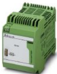
Energy storage device, lead AGM, VRLA technology, 12 V DC, 1.6 Ah.

Please be informed that the data shown in this PDF Document is generated from our Online Catalog. Please find the complete data in the user's documentation. Our General Terms of Use for Downloads are valid ( http://phoenixcontact.com/download )