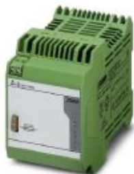
Energy storage device, lead AGM, VRLA technology, 24 V DC, 0.8 Ah.

Please be informed that the data shown in this PDF Document is generated from our Online Catalog. Please find the complete data in the user's documentation. Our General Terms of Use for Downloads are valid ( http://phoenixcontact.com/download )