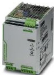
Primary-switched QUINT POWER power supply for DIN rail mounting with SFB (Selective Fuse Breaking) Technology, input: 1-phase, output: 48 V DC/10 A

Please be informed that the data shown in this PDF Document is generated from our Online Catalog. Please find the complete data in the user's documentation. Our General Terms of Use for Downloads are valid ( http://phoenixcontact.com/download )