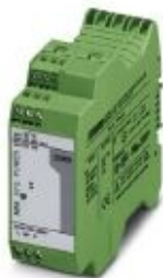
Primary-switched MINI POWER supply for DIN rail mounting, input: 1-phase, output: 24 V DC/1.5 A

Please be informed that the data shown in this PDF Document is generated from our Online Catalog. Please find the complete data in the user's documentation. Our General Terms of Use for Downloads are valid ( http://phoenixcontact.com/download )