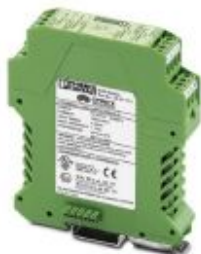
Analog extension module with 4 analog current inputs 4 mA ... 20 mA

Please be informed that the data shown in this PDF Document is generated from our Online Catalog. Please find the complete data in the user's documentation. Our General Terms of Use for Downloads are valid ( http://phoenixcontact.com/download )