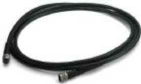
The figure shows a version of the product

Antenna cable, outside diameter: 10 mm (0.4 in.), inner conductor: stranded, attenuation: 1.6 / 2.9 / 5.0 dB at 0.9 / 2.4 / 5.8 GHz, connection: 2 x N (male), cable length: 5 m (16 ft.)