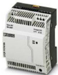
Primary-switched STEP POWER power supply for DIN rail mounting, input: 1-phase, output: 24 V DC/2.5 A

Please be informed that the data shown in this PDF Document is generated from our Online Catalog. Please find the complete data in the user's documentation. Our General Terms of Use for Downloads are valid ( http://phoenixcontact.com/download )