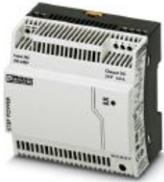
Primary-switched STEP POWER power supply for DIN rail mounting, input: 1-phase, output: 24 V DC/3.8 A

Please be informed that the data shown in this PDF Document is generated from our Online Catalog. Please find the complete data in the user's documentation. Our General Terms of Use for Downloads are valid ( http://phoenixcontact.com/download )