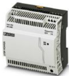
Primary-switched STEP POWER power supply for DIN rail mounting, input: 1-phase, output: 48 V DC/2 A

Please be informed that the data shown in this PDF Document is generated from our Online Catalog. Please find the complete data in the user's documentation. Our General Terms of Use for Downloads are valid ( http://phoenixcontact.com/download )