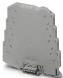
DIN rail housing, Complete housing, tall design, with TBUS option, without vents, width: 6.2 mm, height: 93.1 mm, depth: 102.5 mm, color: light gray (7035)

Please be informed that the data shown in this PDF Document is generated from our Online Catalog. Please find the complete data in the user's documentation. Our General Terms of Use for Downloads are valid ( http://phoenixcontact.com/download )