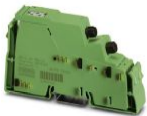
INTERBUS FO branch terminal block, without accessories, with remote bus branch, 24 V DC

Please be informed that the data shown in this PDF Document is generated from our Online Catalog. Please find the complete data in the user's documentation. Our General Terms of Use for Downloads are valid ( http://phoenixcontact.com/download )