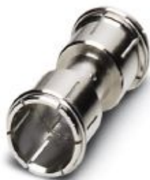
F-connector-to-adapter, plug-to-plug, can be plugged without thread.

Please be informed that the data shown in this PDF Document is generated from our Online Catalog. Please find the complete data in the user's documentation. Our General Terms of Use for Downloads are valid ( http://phoenixcontact.com/download )