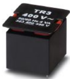
Power modules, pluggable, for EMD-FL-..., supply voltage: 323...456 V AC

Please be informed that the data shown in this PDF Document is generated from our Online Catalog. Please find the complete data in the user's documentation. Our General Terms of Use for Downloads are valid ( http://phoenixcontact.com/download )