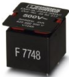
Power modules, pluggable, for EMD-FL-..., supply voltage: 425...550 V AC

Please be informed that the data shown in this PDF Document is generated from our Online Catalog. Please find the complete data in the user's documentation. Our General Terms of Use for Downloads are valid ( http://phoenixcontact.com/download )